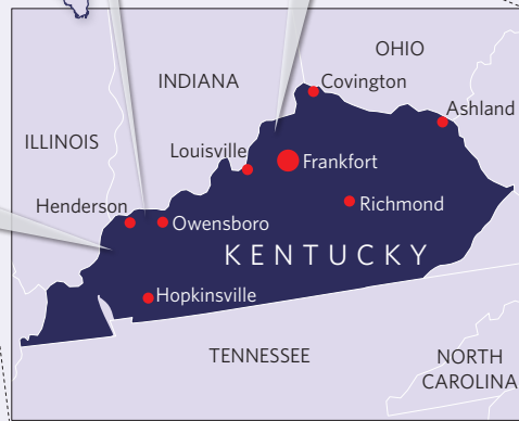
Bioscience-related occupational employment in Kentucky, 2006